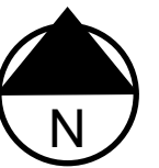
Reference Drawing - Not to Scale