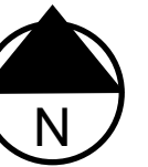
Reference Drawing - Not to Scale